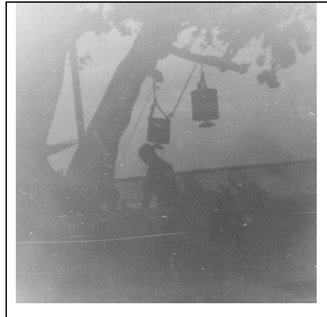
The Showers at Patrol Base Carol

few hours assured a man a hot shower in the early evening. For those who preferred a bath, a few pounds of explosives excavated a swimming hole in the lake near the East edge of the perimeter. An outhouse framed in planks salvaged from Bangalore torpedo crates and screened with burlap sandbags featured a real toilet seat. Of course, this meant that the duty roster assigned enlisted men to work as first cook in the flies' mess hall. This chore involved dragging the receptacle (one third of a steel drum) which rested underneath the