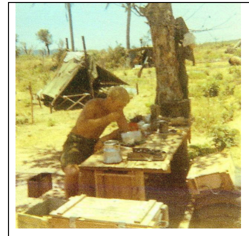
"The Kitchen" (Before final remodeling!)

and rifle pits. A simple plank table with a plank bench along one side made it possible for three men to eat meals in a more pleasant fashion. A chair fashioned from mortar crates usually sat at the head of the table when the men gathered for a communal meal. At other times the comfortable wooden chair sat behind the .50 caliber machine gun atop the defensive position's bunker. Few other soldiers in Viet Nam that year had such a comfortable place to pass their hours on nighttime guard duty.