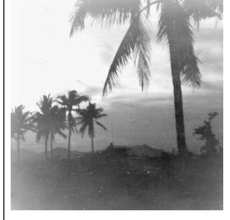
Nightfall at Patrol Base Carol

There were rumors that the patrol base was attacked a few weeks after SRAP left the peninsula. While this is quite possible, it may be a product of the rumor mill...if the rumor is true.