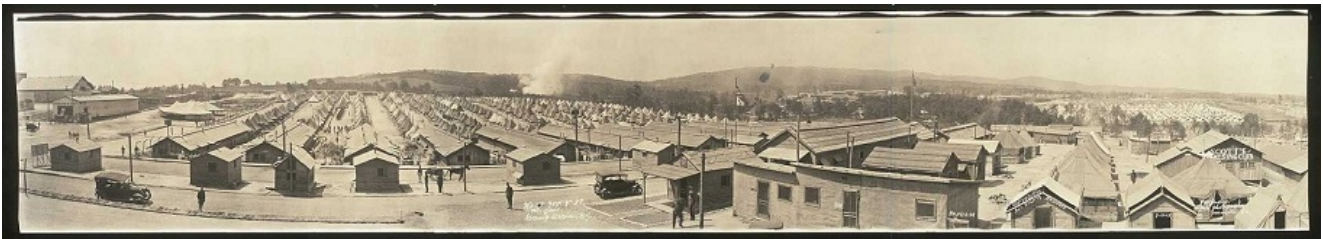
Camp Sevier, Greenville, South Carolina, World War I