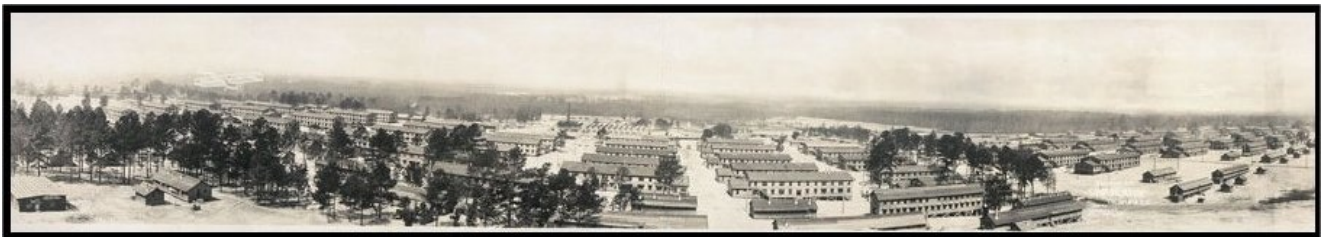
Camp Jackson, Columbia, South Carolina, World War I

On September 30, 1918, the strength of the Division was about 8700 officers and men. At the end of October the strength totaled approximately 9,200 and, on December 31, reached a peak of some 15,400 officers and men.