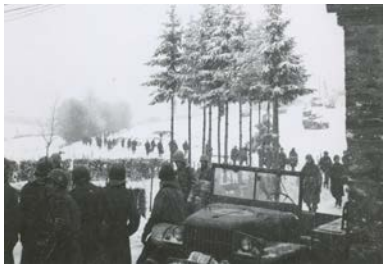
Company C - Near Bastogne in January of 1945.