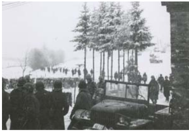
Company C - Near Bastogne in January of 1945.