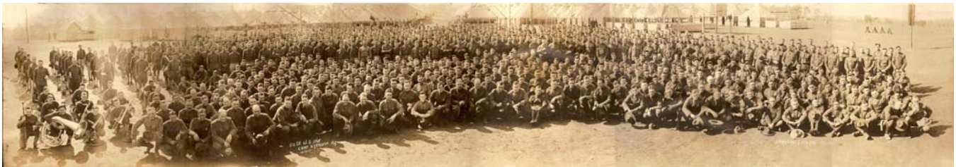
50th U.S. Infantry - 16 October 1917 - Camp Syracuse, New York.

This recruitment and training camp was set up on the New York State Fairgrounds in the Lakeland section of Syracuse near Lake Onondaga.