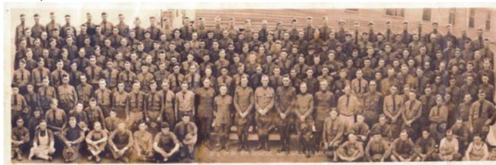
Company "L" shown here in Washington, DC in May of 1918.

As the 20th Infantry Division began to take shape and train for deployment to Middle and Lower Silesia near Germany, the Spanish Influenza outbreak decimated the regiment's ranks as well as those of the entire military installation. The entire camp was quarantined on September 23rd, 1918, until the outbreak subsided. Hundreds died from this outbreak.