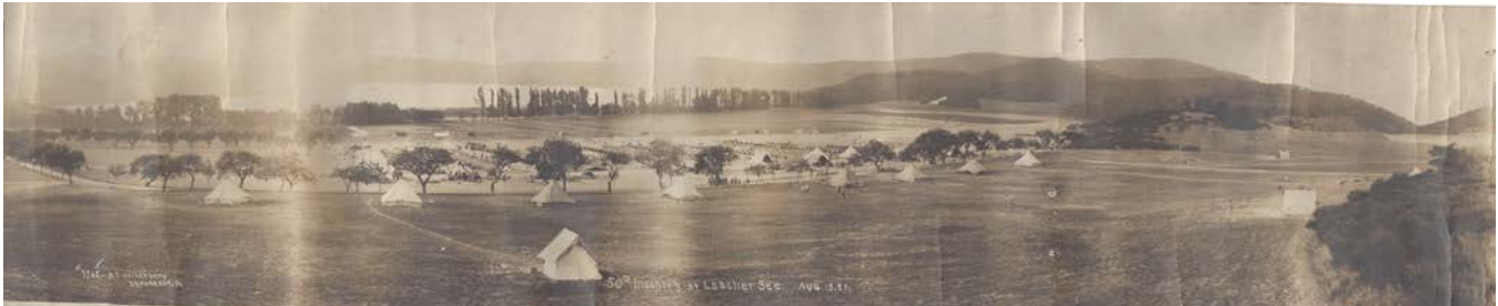
50th Infantry at Laacher See, August, 1921