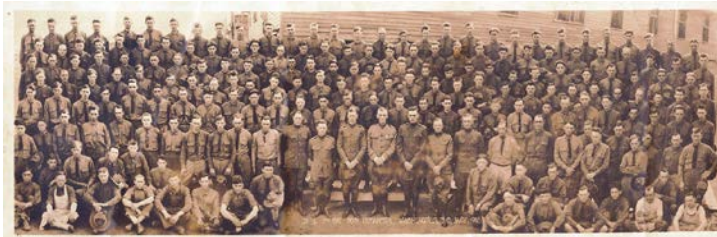
Company "L" shown here in Washington, DC in May of 1918.

As the 20th Infantry Division began to take shape and train for deployment to Middle and Lower Silesia near Germany, the Spanish Influenza outbreak decimated the regiment's ranks as well as those of the entire military installation. The entire camp was quarantined on September 23rd, 1918, until the outbreak subsided. Hundreds died from this outbreak.