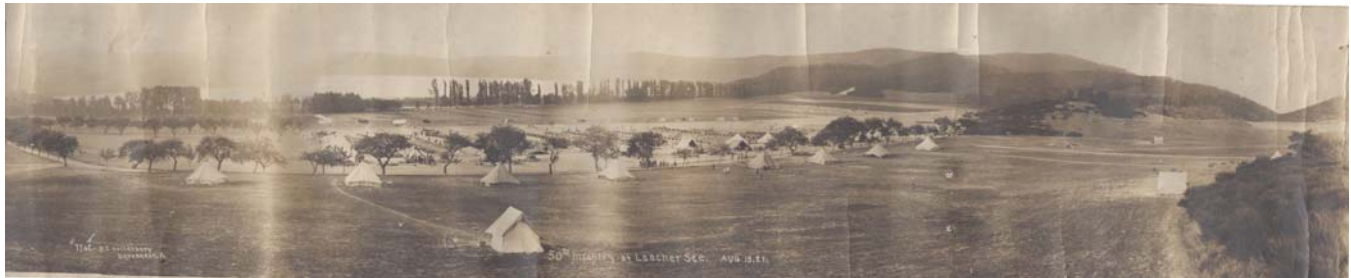
50th Infantry at Laacher See, August, 1921