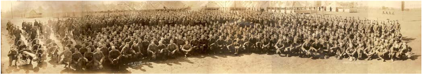
50th U.S. Infantry - 16 October 1917 - Camp Syracuse, New York.

This recruitment and training camp was set up on the New York State Fairgrounds in the Lakeland section of Syracuse near Lake Onondaga.