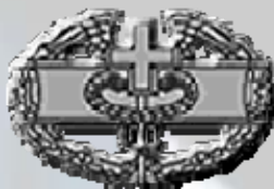
COMBAT MEDIC BADGE