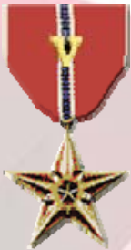
Bronze Star (Valor)