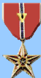
Bronze Star (Valor)