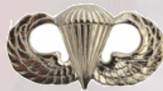
Airborne Jump Wings (Basic Parachutist Badge)