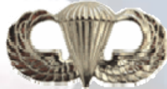
Airborne Jump Wings (Basic Parachutist Badge)