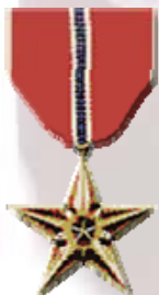
Bronze Star (Unconfirmed)