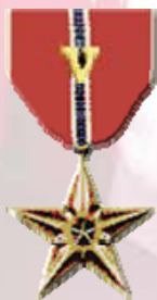
Bronze Star (Valor)