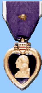
Purple Heart w/1olc