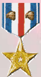
Silver Star With two Oak Leaf Clusters