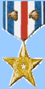
Silver Star w/2olc