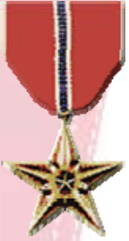
Bronze Star (Unconfirmed)