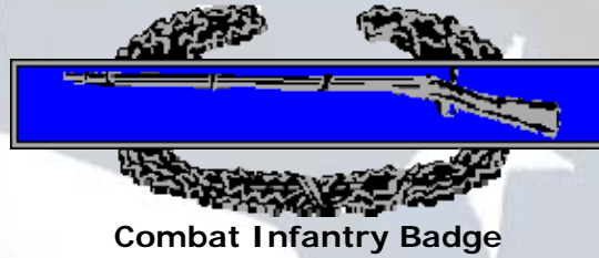
Combat Infantry Badge