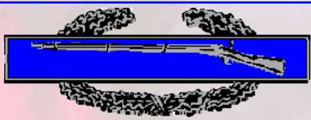
Combat Infantry Badge