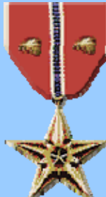
Bronze Star w/2 OLC