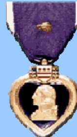
Purple Heart w/OLC