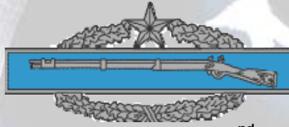
Combat Infantry Badge, 2 nd Award (Combat Infantry Service in Korea and South Vietnam)