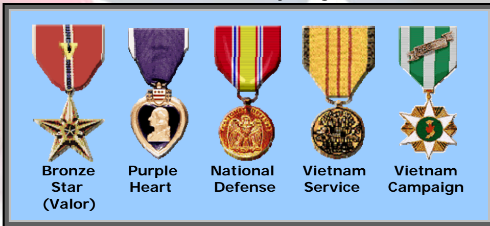
Bronze Star (Valor)