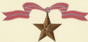
THE BRONZE STAR MEDAL WITH "V" DEVICE FOR VALOR