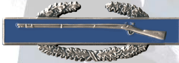
Combat Infantry Badge