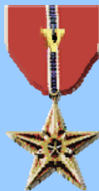
Bronze Star (Valor)