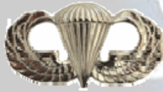
Airborne Jump Wings (Basic Parachutist Badge)