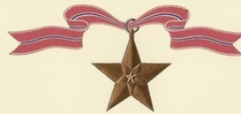
THE BRONZE STAR MEDAL FOR MERITORIOUS SERVICE