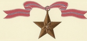
THE BRONZE STAR MEDAL WITH "V" DEVICE FOR VALOR