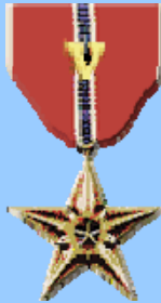
Bronze Star (Valor)