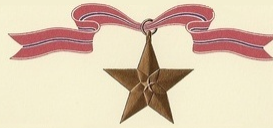
THE BRONZE STAR MEDAL FOR MERITORIOUS SERVICE