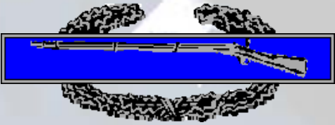
Combat Infantry Badge