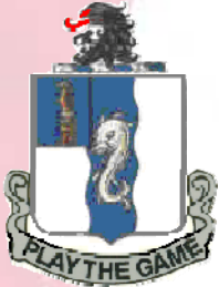
50 TH INFANTRY