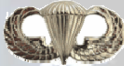
Basic Parachutist Badge