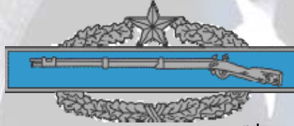
Combat Infantry Badge, 2 nd Award (Service in Korea and South Vietnam)