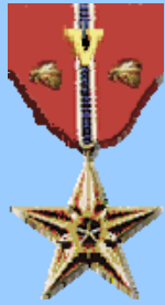
Bronze Star Valor 3 Awards