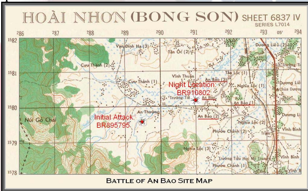
BATTLE OF AN BAO SITE MAP