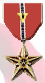
Bronze Star (Valor)