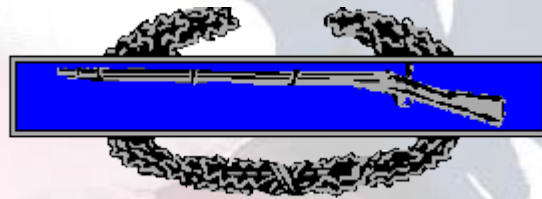
Combat Infantry Badge