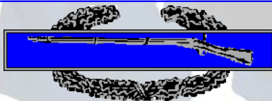
Combat Infantry Badge