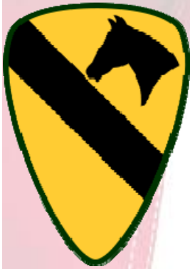
1 ST CAVALRY DIVISION (AIRMOBILE)