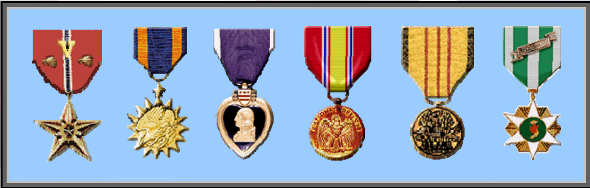
Bronze Star For Valor 2nd Oak Leaf Cluster