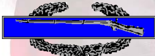
Combat Infantry Badge