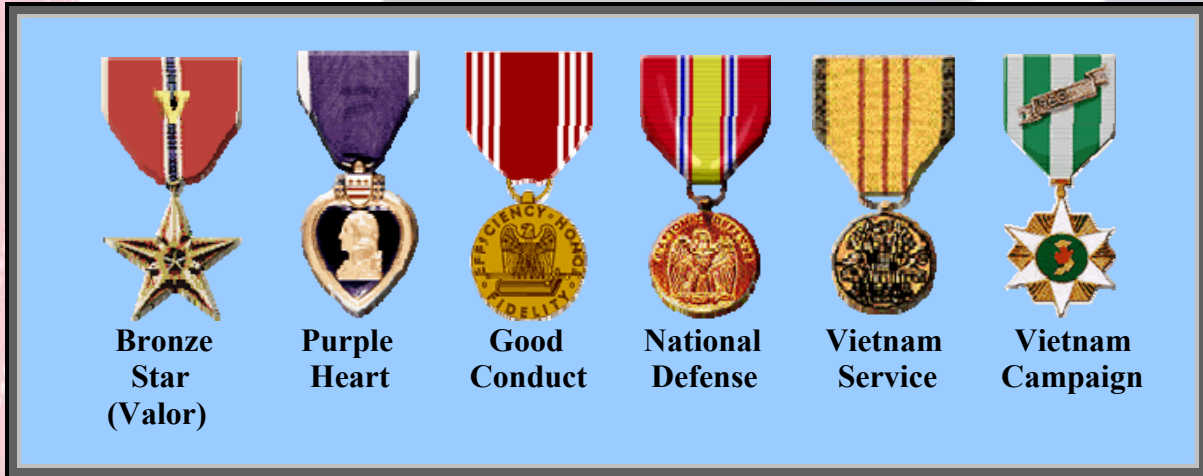
Bronze Star (Valor)