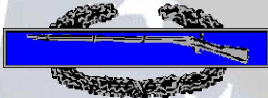
Combat Infantry Badge