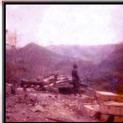
Jerone Lowe: photo taken sometime during 1969