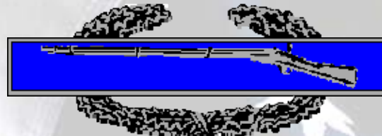
Combat Infantry Badge