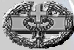
Combat Medical Badge