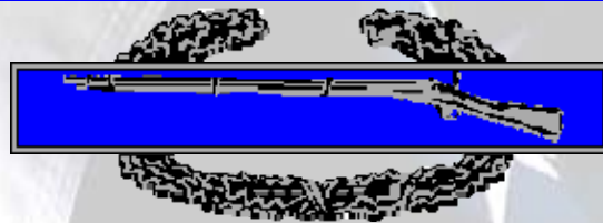
Combat Infantry Badge