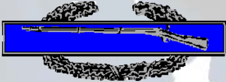
Combat Infantry Badge