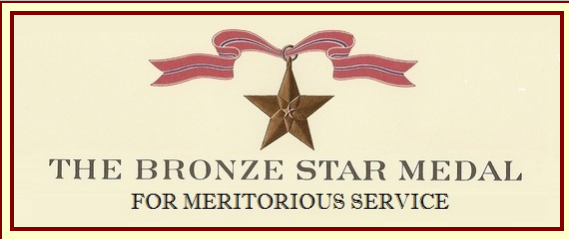
HQ 173RD AIRBORNE BRIGADE