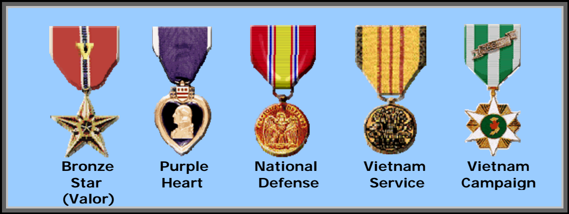
Bronze Star (Valor)