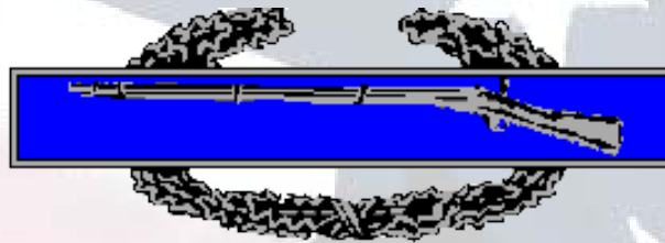
Combat Infantry Badge