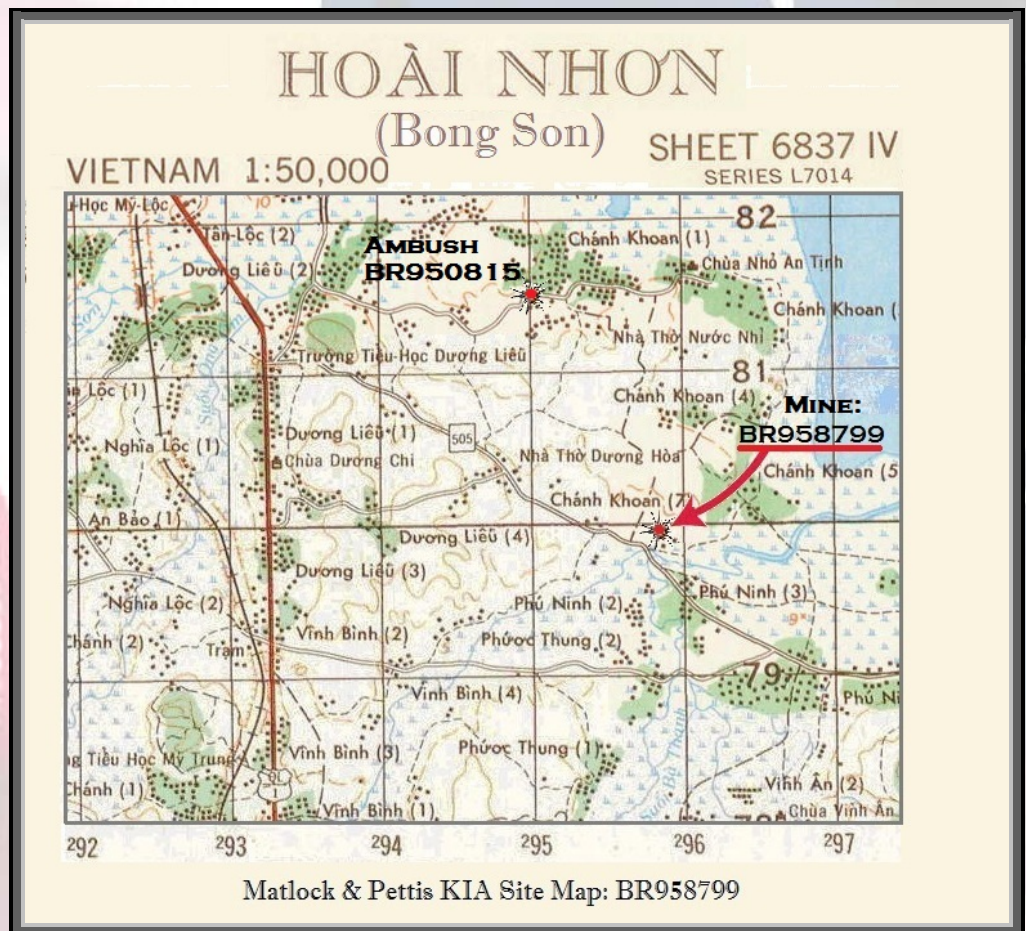
Matlock & Pettis KIA Site Map: BR958799