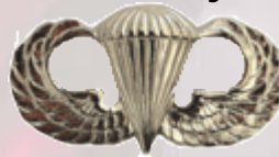
Airborne Jump Wings (Basic Parachutist Badge)