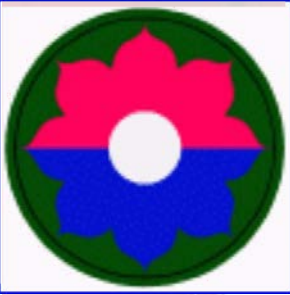
9TH INFANTRY DIVISION

Date of Incident: Unknown, Date of Casualty: March 14, 1968, Days in Country: 165 Casualty Type A2, Hostile, Died of Wounds, MFW, Panel 44E - Row 052