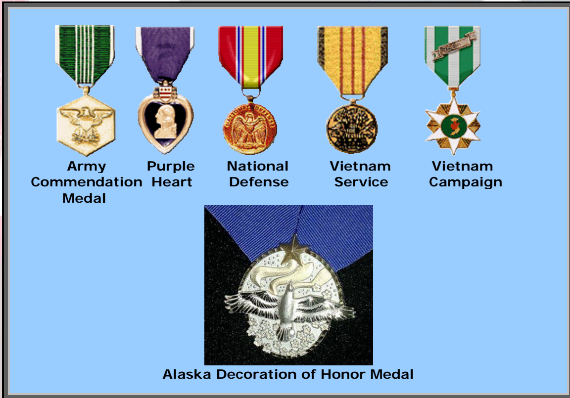
Army Commendation Medal