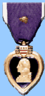
Purple Heart (2 Awards)