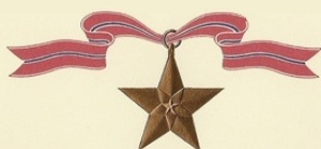
THE BRONZE STAR MEDAL WITH "V" DEVICE FOR VALOR