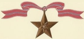
THE BRONZE STAR MEDAL WITH "V" DEVICE FOR VALOR HQ 1ST FIELD FORCE VIETNAM