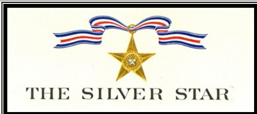
HQ, 1ST CAVALRY DIVISION (AIRMOBILE)