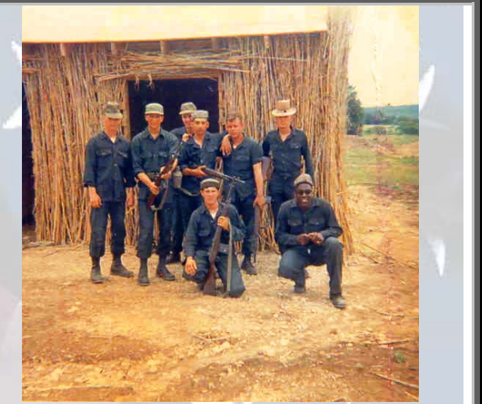
Vietnamese Village set up at Fort Hood, Teaxs