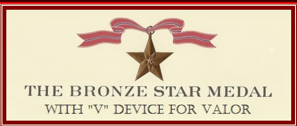
HQ, I FIELD FORCE VIETNAM)