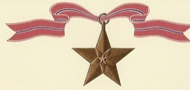
THE BRONZE STAR MEDAL FOR MERITORIOUS SERVICE