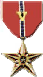
Bronze Star For Valor