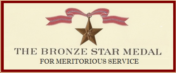
THE BRONZE STAR MEDAL FOR MERITORIOUS SERVICE

HQ 173RD AIRBORNE BRIGADE (SEPARATE) 1967 GENERAL ORDERS NUMBER 2056