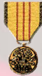
Vietnam Service Medal