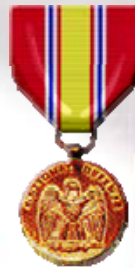
National Defense Service Medal