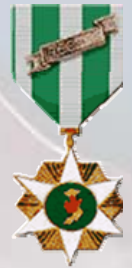
Vietnam Campaign Medal