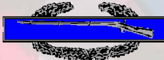
Combat Infantry Badge