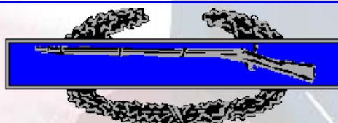
Combat Infantry Badge