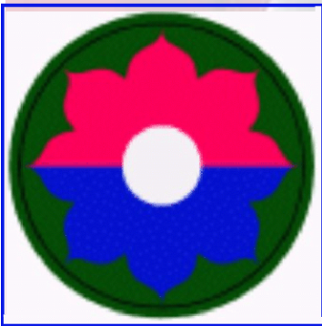
9TH INFANTRY DIVISION