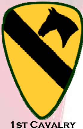
1ST CAVALRY DIVISION (AIRMOBILE)